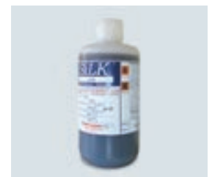
Yellow cards on packaging