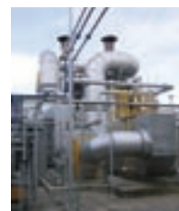
Boiler of direct-combustion type deodorizing furnace to recover waste energy at a film manufacturing plant