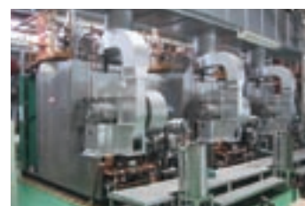
Through-flow boiler to control flow rates