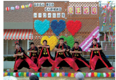
The Yosakoi Dance Team from Namie Hitachi Chemical Co., Ltd., visits a senior citizen's home (September 2004)

The Group administers a charity for disadvantaged children, contributes to social welfare facilities, and serves as volunteers, both at home and abroad.