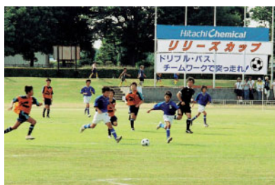
Shimodate Works of Hitachi Chemical hosts the Lilies Cup Yuki Junior Soccer Tournament (August 2004)