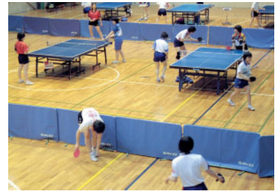
Table tennis lesson for children by Women's Table Tennis Club in Yamazaki Works of Hitachi Chemical (May 2004)