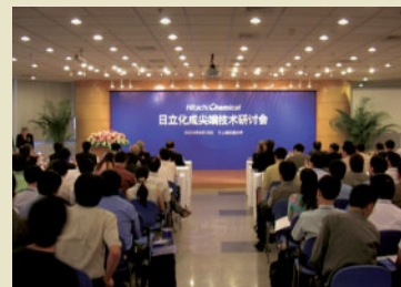
* Shanghai Jiao Tong University: Established in 1896, the university is one of the most traditional universities in China and is designated as one of the priority universities. Jiang Zemin, the former president of the People's Republic of China, graduated from the university.