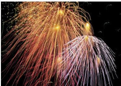
Kawashima Fireworks Display cosponsored by Shimodate Works of Hitachi Chemical every year (August 2004)

Each site of the Group cosponsors local events like festivals and campaigns and provides support to public gardens, museums, and local community centers.