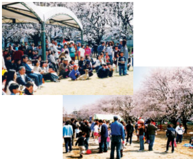
The 19th Cherry Blossom Festival hosted by Goshomiya Works of Hitachi Chemical, attended by approximately 2,000 people (April 2004)

Each site of the Group hosts a variety of events every year, which deepens the friendship with local residents. Many employees, their families, and local residents participated in the events.