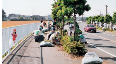
Joint Clean-Up Campaign by the West Ibaraki Area of the Hitachi Chemical Group in which 330 employees participated (October 2004)

Employees conduct clean-up campaigns to maintain the clean environment of the community, not only around the sites but also nearby beaches and streets.