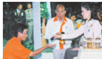
Meeting Princess Ubol Ratana at the To Be Number One Exhibition