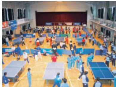
More than 100 junior high school students from Hitachi City, Ibaraki attended a table tennis lesson hosted by the Women's Table Tennis Team at the Yamazaki Works of Hitachi Chemical in April 2006.

The Group contributes to society and local communities by sponsoring sports events, supporting club activities and holding sports training programs for children who will be the leaders of the next generation.