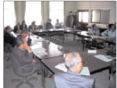
Plant tour at Shimodate Works of Hitachi Chemical