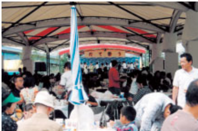
Hitachi Chemical's Shimodate Works hosted local residents at the Shimodate Works Festival (September 2005).

Every Group site hosts a variety of events every year which deepen relationships with local residents.