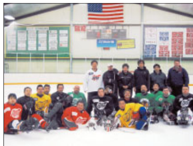
Hitachi Chemical donated funds to the Japan National Ice Sledge Hockey Team in October 2005. Ice Sledge Hockey is a modified version of ice hockey for athletes with lower body disabilities.