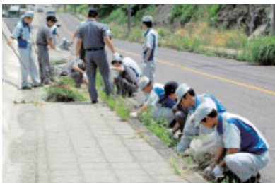
Clean-up campaign regularly conducted by Hitachi Chemical Automotive Products Co., Ltd. in which 70 employees from every department participated in June 2005

Employees conduct clean-up campaigns to maintain the cleanliness of community environments, not only around our business sites but also nearby beaches and streets.