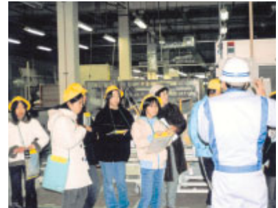
Plant tour at Goshomiya Works of Hitachi Chemical

Electric Machinery Co., Ltd., Hitachi Powdered Metals Co., Ltd. and Hitachi AIC Inc.