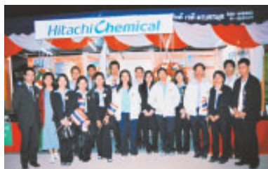
Hitachi Chemical Automotive Products (Thailand) Co., Ltd.

Hitachi Chemical is actively involved in the Thai national project to stop drug abuse called "To Be Number One Project." The company promotes activities that raise the awareness of employees and their families of the dangers of drug abuse.