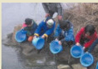
Release of juvenile salmon into the Kinugawa River in February 2005

Shimodate Works of Hitachi Chemical utilizes an industrial water treatment facility to make every effort to prevent wastewater generated at the Works from polluting the river. The Works supports conservation of the Kinugawa River's natural environs based on an agreement with the Kinu-Kokai Fisheries Cooperative in Ibaraki Prefecture governing the discharge of wastewater from the Works and the protection and breeding of fish.