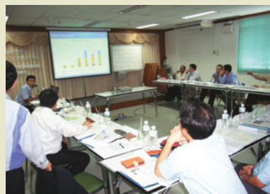
CSR seminar at Hitachi Chemical Automotive Products (Thailand) Co., Ltd.

one of these seminars was held in Thailand with Hitachi Chemical