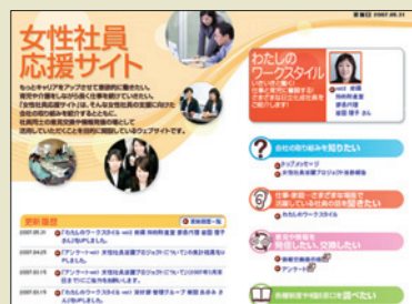
Female Employee Cheer intranet site

environment in which diverse human resources can freely demonstrate their potential.