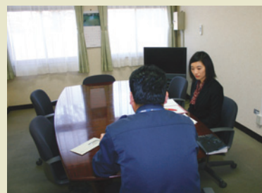
Counseling session (back of employee shown)

only directly alleviate stress, but also lead to the cultivation of a working atmosphere in which employees feel comfortable speaking with a counselor.