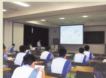
Training for OSH Promoters

In 2007, we will expand this system to the entire Group to further strengthen safety and health activities at the workplace.