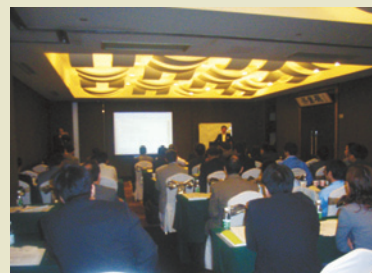
Environment and Safety Presentation

Opinions were actively exchanged during the presentation over the cases of improvements made at each company. During the audit, unsafe situations were thoroughly identified and measures to reduce risk were discussed.