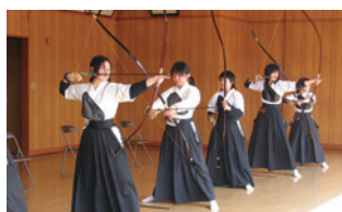
Japanese archery hall "Go-Ou-Kan" on the site of Goshomiya Works, open to local Japanese archery enthusiasts