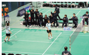
Activities of Ibaraki Prefecture's Western Region Badminton Club, runner-up in the Second Section of the Japan League 2006