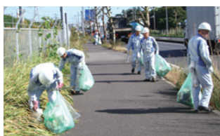
Clean-up campaign by the Group for a Cleaner National Route 16 at Goi Works