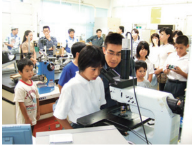
The Summer Vacation Workplace Family Tour held in July and August 2006 at Shimodate Works welcomed a total of 35 parents and children.