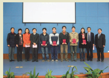
Scholarship award ceremony at Shanghai Jiao Tong University

The Hitachi Chemical Group intends to maintain its active commitment to support highly motivated students in an effort to contribute to the development of human resources for the future.