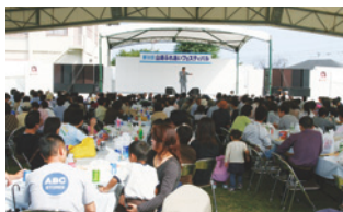
"Fure-ai" (Get Together) Festival at Yamazaki Works (Sakuragawa)

The Hitachi Group operates six foundations that contribute to society in Japan and overseas. The Hitachi Chemical Group supports individuals, companies and organizations that are involved in social contribution activities through donations to four of these foundations.