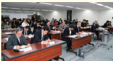
Over 300 employees listened to the lecture, which was broadcast to each business site via the Intranet