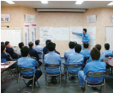
CSR Workshop Discussion held at Shin-Kobe Electric Machinery's Saitama Works

In fiscal 2007, we extended this activity to Group companies and held discussions in December and February at the Saitama Works and Tokyo Head Office of Shin-Kobe Electric Machinery Co., Ltd., respectively. Each workshop was attended by around 20 employees, who offered their solutions for sustainable development.