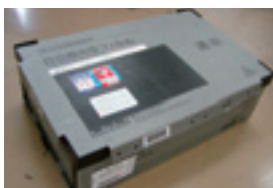
Plastic returnable container for "Photec"

The Hitachi Chemical Group is reducing the consumption of packaging materials to lower the environmental burden of