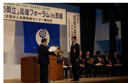
Receiving the award from the Governor of Ibaraki

In January 2009, Hitachi Chemical's Yamazaki Works and Hitachi Chemical Techno Service Co., Ltd. received the grand prize in the Support for Balancing Work and Childcare Section of the Childcare Supporting Companies Awards organized by Ibaraki Prefecture. The prize is awarded to companies that are leading in these areas through innovative efforts, such as by introducing childcare programs that exceed legal requirements for childcare and family leave.