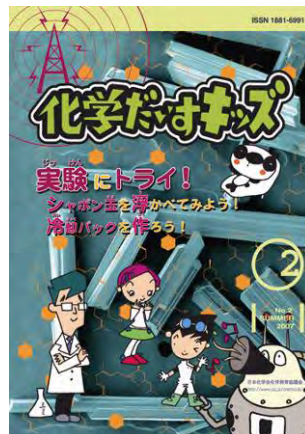
Cover design for Daisu-Kids