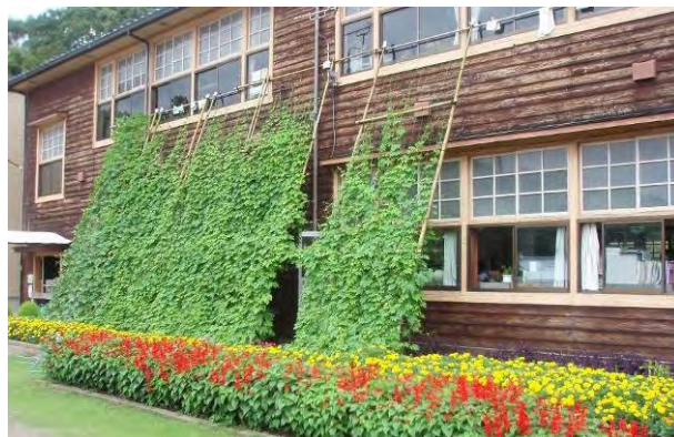
Green Curtain at Fukuroda Elementary School, Daigomachi, Ibaraki