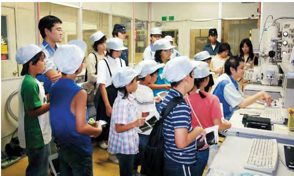
Workplace tour for families at the Shimodate Works

Hitachi Chemical Shimodate Works, Goshomiya Works, Shin-Kobe Electric Machinery Co., Ltd., Hitachi Powdered Metals Co., Ltd., Hitachi AIC Inc.