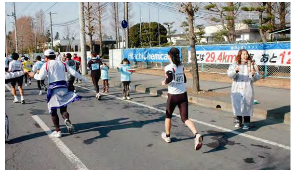
Katsuta Marathon, supported by the Yamazaki Works