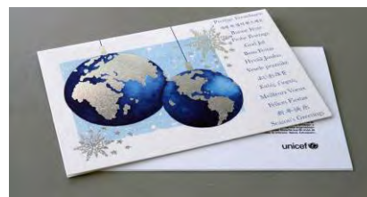
Japan Committee for UNICEF Christmas cards

One of Hitachi Chemical's social contribution efforts since 2007 has been the bulk purchase of holiday greeting cards sold by the Japan Committee for UNICEF (United Nations Children's Fund). This project replaced the previous practice of having each division place separate orders to different companies. Approximately 50% of the purchasing price of these cards is used to fund UNICEF activities that effectively support the future of children in more than 150 countries.