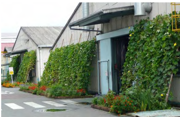
Green Curtain at Namie Hitachi Chemical Co., Ltd.