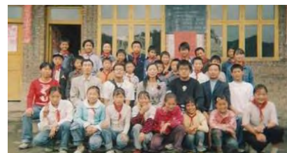
Elementary school children in Sichuan Province

Since 2007, Hitachi Chemical (Shanghai) Co., Ltd. (HCSH: China) has been donating money to elementary schools in deprived areas of Sichuan Province and delivering winter clothing to children attending the schools. The initiative began when a family member of a Hitachi Chemical employee assigned to HCSH until 2007 learned about the everyday lives of children in deprived areas via the Internet and began donating clothing. HCSH has continued the effort after the employee's return to Japan.