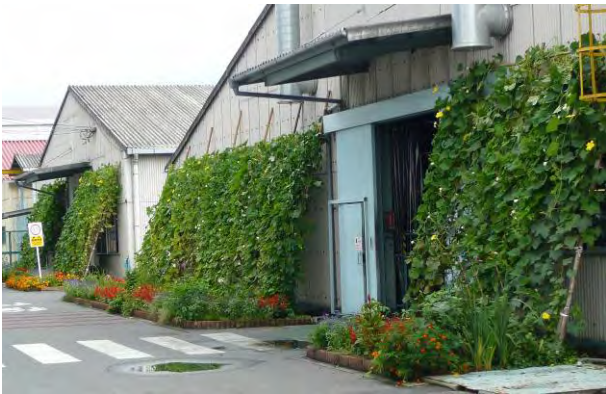
Green Curtain at Namie Hitachi Chemical Co., Ltd.