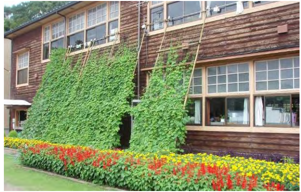
Green Curtain at Fukuroda Elementary School, Daigomachi, Ibaraki